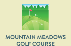
MOUNTAIN MEADOWS GOLF COURSE